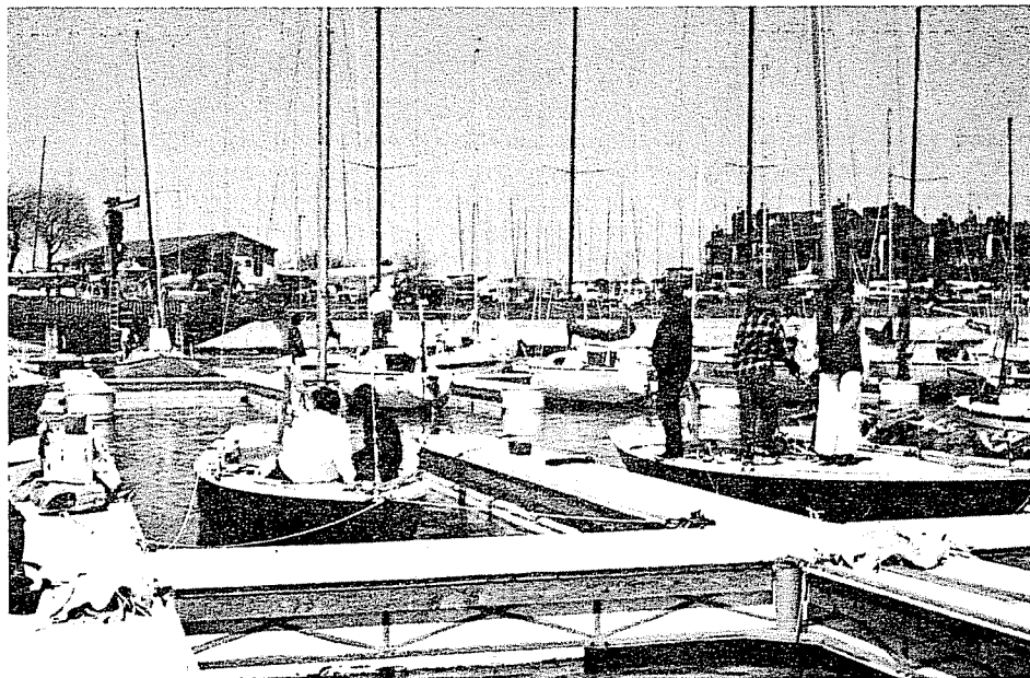
Rush Creek Yacht Club on Lake Ray Hubbard near Dallas, Texas