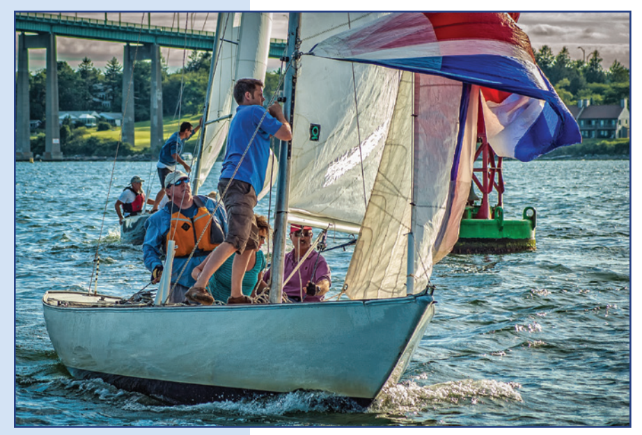
FLEET 17: Icea 15, during Wednesday Fleet 9 racing.