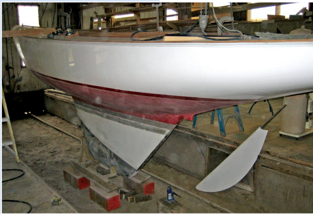
Hull, fiberglass deadwood (white), lead keel and rudder (separated)

As memories of the snowiest winter on record begin to melt away it's finally time to contemplate spring maintenance. Nothing is more daunting than tackling the condition of your boat below the waterline. Here are a few tips from the pros: