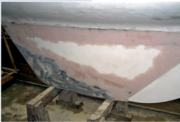
Seam filler applied at deadwood seams.

When new, the bottom surfaces were sanded smooth and seams were filled with underwater body filler. If you can see a seam, chances are the filler has failed and needs to be routed out and new filler applied. The filler fails over time due to temperature change. The more extreme the thermometer swing, the more likely the filler will flake off. (photo #2)