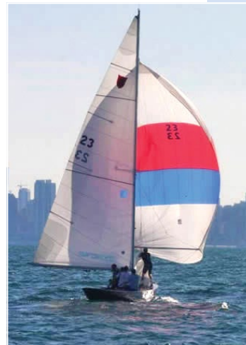
FLEET 1: Shields Rascal #23