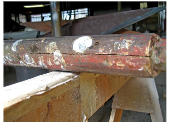
A crack in the forward edge of the rudder.

Study the wear on the rudder shaft while the boat is still high and dry. You can take up some of the wiggle by replacing the bronze heel casting. If you notice a crack on the forward seam of the rudder that is deep enough to allow for water to penetrate, it's time to replace the rudder. (photo #3) Replacing the rudder, shaft, and the heel casting will improve performance as you have better control of the helm.