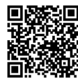
YachtScoring Mobile Site