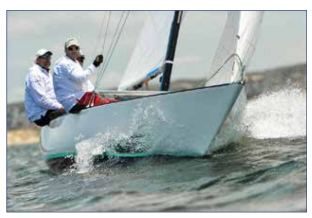
Team Rolly #209