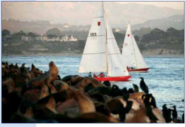
#103 Stillwater and #175 Meritage in Twilight