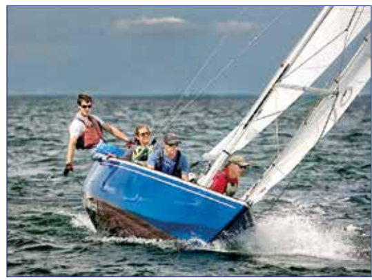
#230 Bolero II at the Vineyard

Martha's Vineyard is beginning to thaw and Fleet 8 is ready to get back on the water. We are expecting 8 boats on the line for our July and August series and we are hoping for a repeat of the fantastic sailing conditions we enjoyed last season. Please join us this summer for our annual regatta or one of the many other sailing events held at the Edgartown Yacht Club.