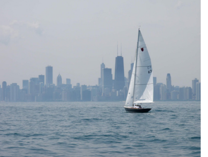
From Top Left Clockwise Sapphire #130 Hellcat #45 Insidious #196 Yankee Girl #150 Dauntless #63 Peanut #88 Trouble #67