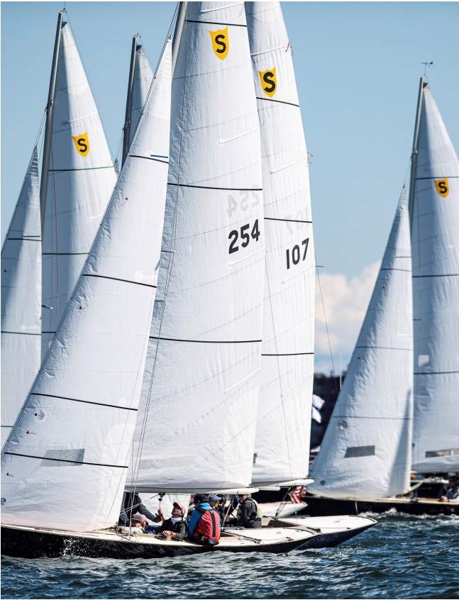
Photo Gallery Upper Left: Solid Gold in Newport, Upper Right: Tiburon in Monterey