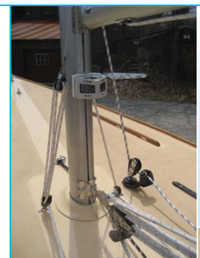
Cape Cod Shipbuilding Co. Wareham, MA www.capecodshipbuilding.com

The new Shields #258 sold in the fall and will race in the Newport fleet this summer. Thankfully this and other new boat orders have helped us weather these tough economic times. As always, we are thankful for the parts, storage and repair customers who tide us over until boat orders begin to pick up again. We encourage you to use sailing as a stress relief this summer. The simple things in life like being on the water can help wash away a days worries. We hope to see you all on the water!